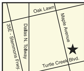
Heritage World Headquarters

THIS AUCTION IS PRESENTED AND CATALOGED BY HERITAGE AUCTIONS, INC.