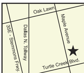
Heritage World Headquarters

THIS AUCTION IS PRESENTED AND CATALOGED BY HERITAGE AUCTIONS, INC.